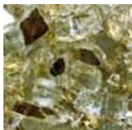
Glass Media Glacier (standard)

Scan this code to see our Northern Firelights burn video