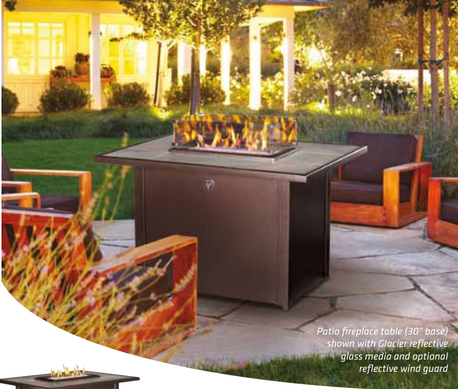
Patio fireplace table (30" base) shown with Glacier reflective glass media and optional reflective wind guard