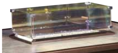
Reflective Wind Guard