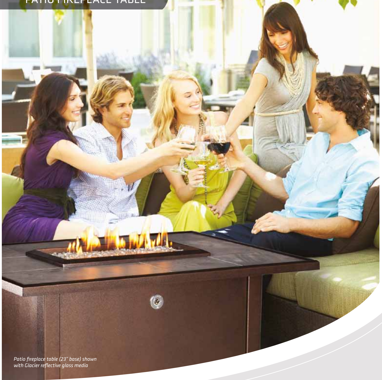
Patio fireplace table (23" base) shown with Glacier reflective glass media

Take the chill out of the autumn air or get an early taste of spring. With the simple push of a button, the Northern Firelights Patio Fireplace Table gives you more time to enjoy the warmth with family and friends. Designed exclusively for outdoor use, Northern Firelights brings a new dimension to your entertaining!