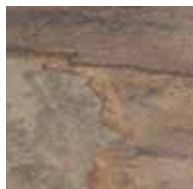
Porcelain Tile Kit Cypress