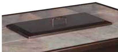
Metal Protective Lid